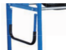
Push-and-pull bar Article no. zsw-646.004