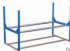
Shelf Article no. gsw-646.003