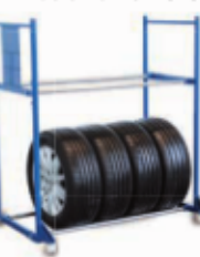
Feet for tyre stand Article no. zsw-646.007