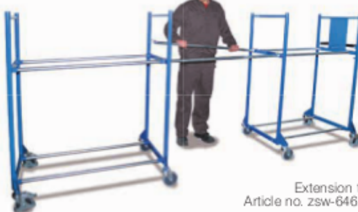
Extension tube Article no. zsw-646.008