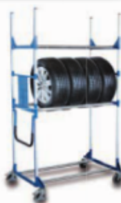
Distance pieces Article no. zsw-646.009