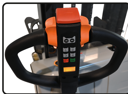
Samtliga modeller utrustade med pinkodslås.